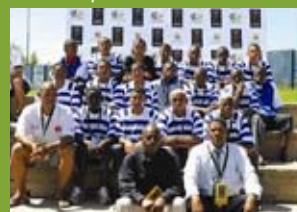
SAFA Sedibeng Select