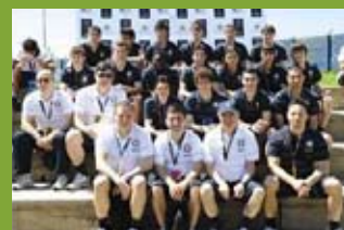
FC Inter Milan