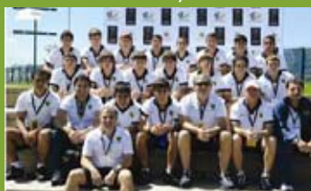
CA Boca Juniors