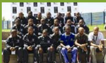
SAFA Johannesburg Select